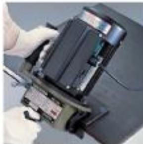
Beveling steel plates