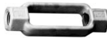
Sizes 3/8" to 1 3/4"