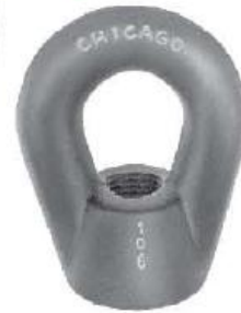
Drilled & Tapped