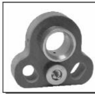
PART NO. BG-2 PRICE: USE WITHOUT FERRULE NELSON P/N #751-022-000

FOOT ONLY BG-2-1 SPARK SHIELD ONLY BG-2-2 VALVE ASSY. BG-2-3