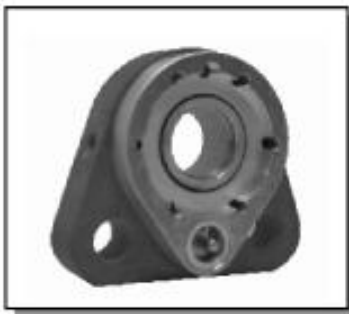
PART NO. BG-1 PRICE: USE WITH FERRULE NELSON #751-929-999