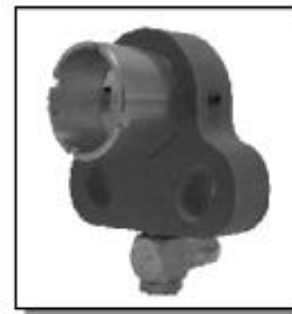
PART NO. BG-3 PRICE: USE W/ARC-656 GAS UNIT

FOOT ONLY BG-2-1 SPARK SHIELD ONLY BG-2-2 VALVE ASSY. BG-2-3