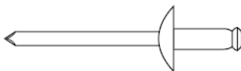
PART NUMBER COMPARISON - LARGE FLANGE ALUMINUM RIVET/ALUMINUM MANDREL